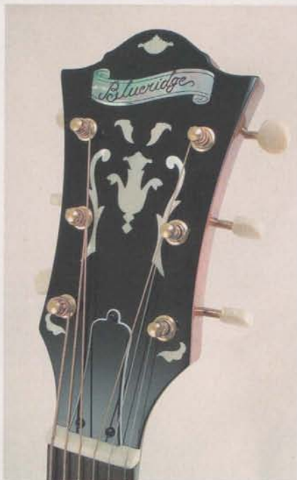
The BG-160's headstock is adorned with pearl inlays and a cool looking abalone logo banner.

The Blueridge factory apparently takes its product consistency very seriously, and this extends to the fretwork, finishes, and cosmetic details. Despite the $300 price difference between the BG-40 and BG-160, both